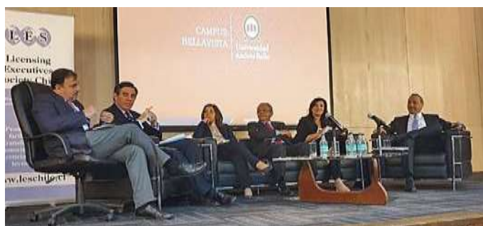
Panelists discuss changing Chilean Industrial Property Law.

During the event, the modifications to the industrial property law and the opportunities and impact on the R&D ecosystem were reviewed. This bill is currently in its final stages.