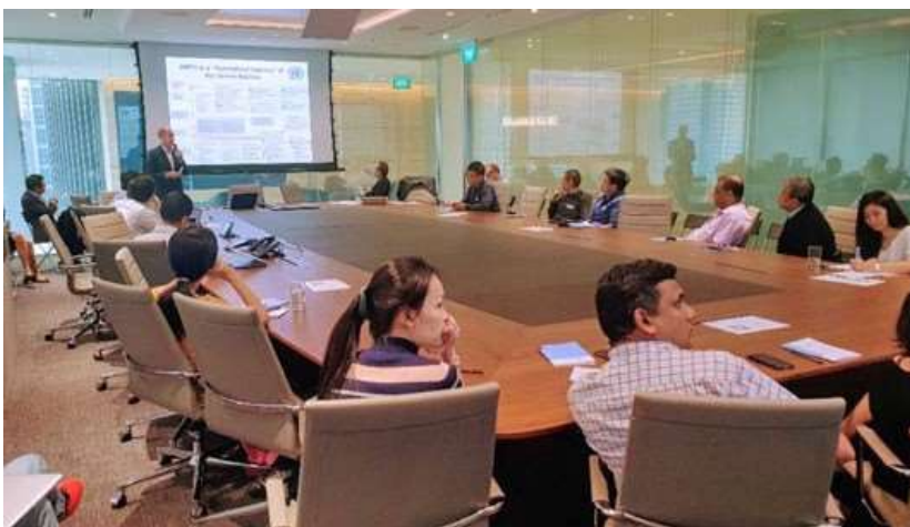
The attendees were provided insights on WIPO’s services and case examples.