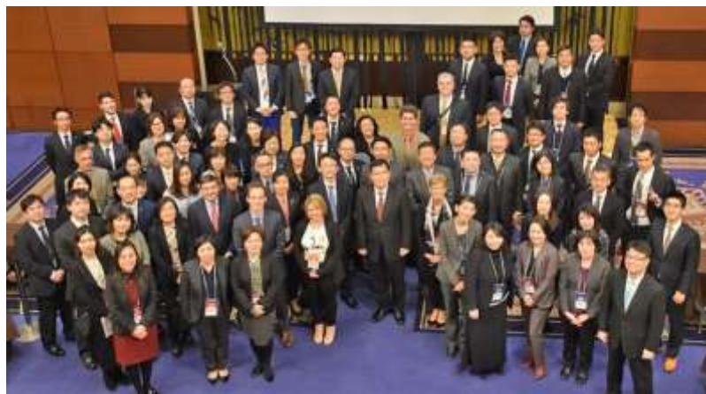
Participants at the ID5 User Session in Tokyo.

After the ID5 Meeting, an optional event cultural event was held. The attendees enjoyed wearing Japanese traditional kimonos and making Japanese green tea. ■