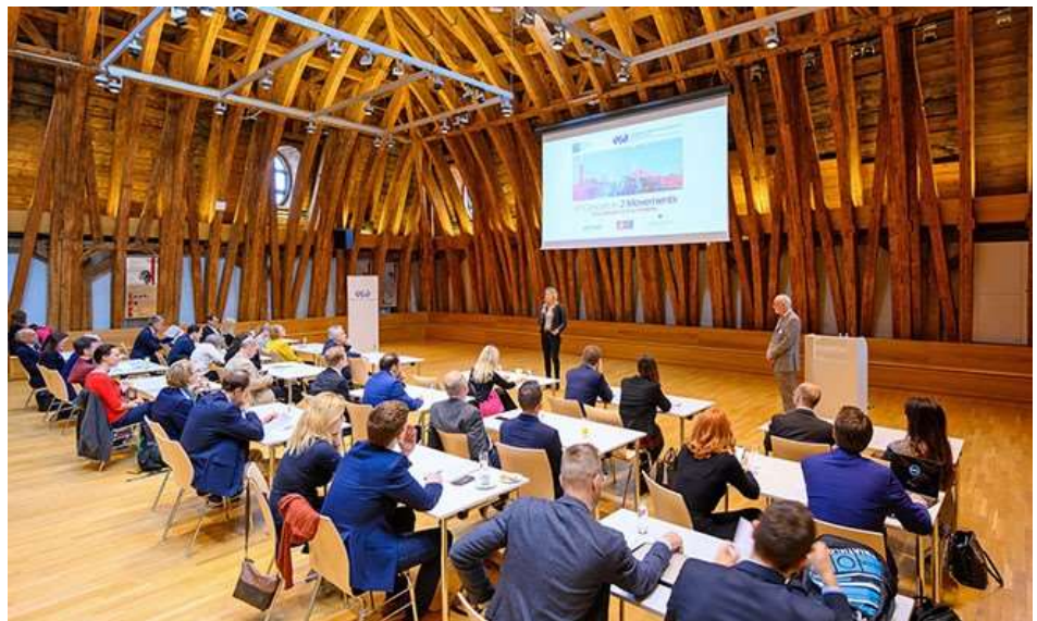
Attendees enjoyed both the presentations as well as the networking opportunities at the conference.