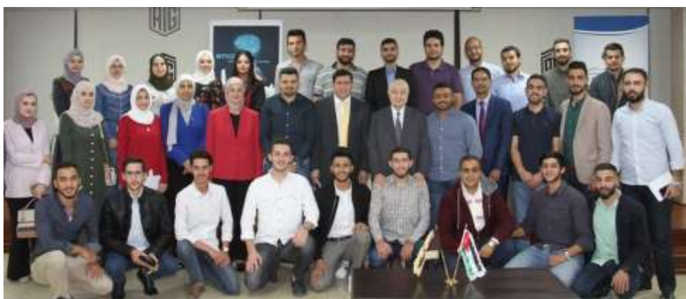
The participants of the IP workshop.