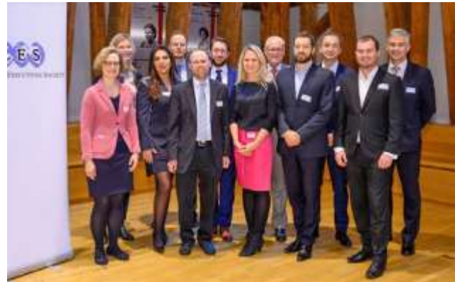
Speakers at the joint Regional Conference spoke on IP topics.