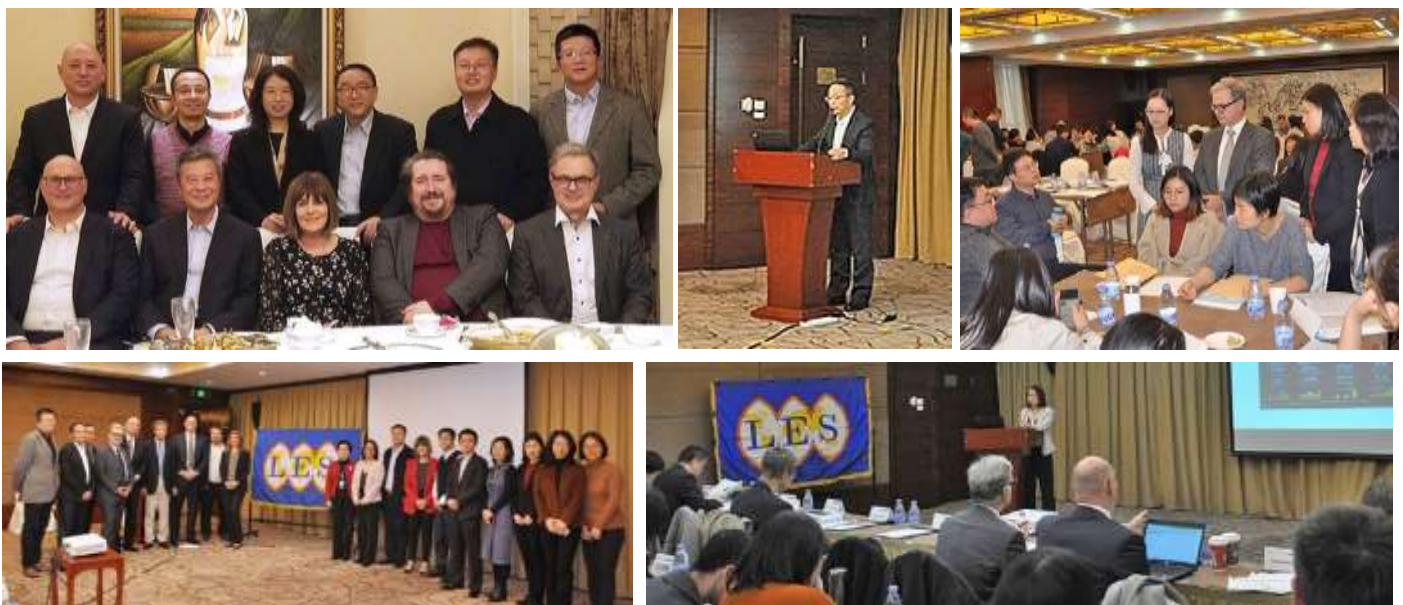
Speakers and participants at the LESI Education Seminar in Beijing, China. See more photos on Page 12.