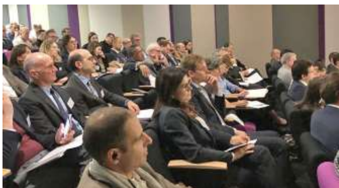
Audience at roundtable meetings at the Second Annual Conference on the Future of Standard Essential Patents and FRAND Licensing.

In Toulouse on November 22, the first Round Table was organised in collaboration with the CNCPI on Licensing. Speakers from industry, public research, SMEs and private practice presented their difficulties and successes negotiations.